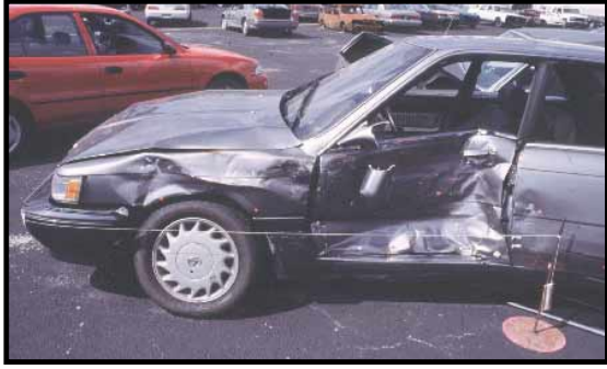
Figure 2. Case vehicle for a 22.5 km/h (14 mph) crash resulting in aortic tear.

The case vehicle was a 1990 Lexus ES-250 equipped with 3-point restraints for both frontal seating positions. The vehicle was equipped with a driver air bag, which deployed in the crash. The 62 year-old male driver was wearing the available 3-point lap and shoulder restraint.