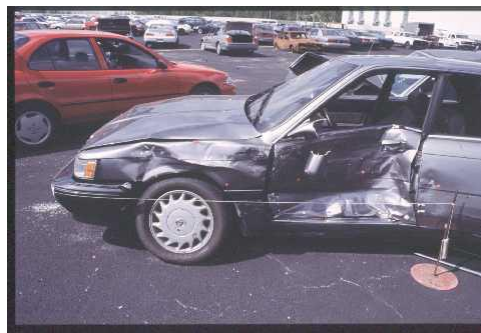
Figure 2. Case 96-008S Vehicle Showing Typical Side Damage Pattern for Aortic Injury

Viano (1983) described a range of aortic injuries involving partial tears to the vessel wall, typically the intimal and medial layer. In these cases, the intact adventitia and surrounding plura may limit blood loss. This passive condition is sensitive to a secondary rupture that may occur within weeks of the initial injury. The difficulty in identifying the presence of passive aortic injuries and the potential fatal consequence of these injuries increases the importance of developing criteria from the crash scene to predict these injuries.